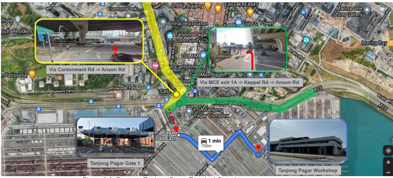
Figure 3.2: Route to Tanjong Pagar Terminal Gate 1